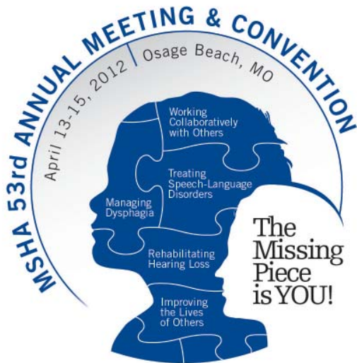
Exhibit Hall Hours - Tentative